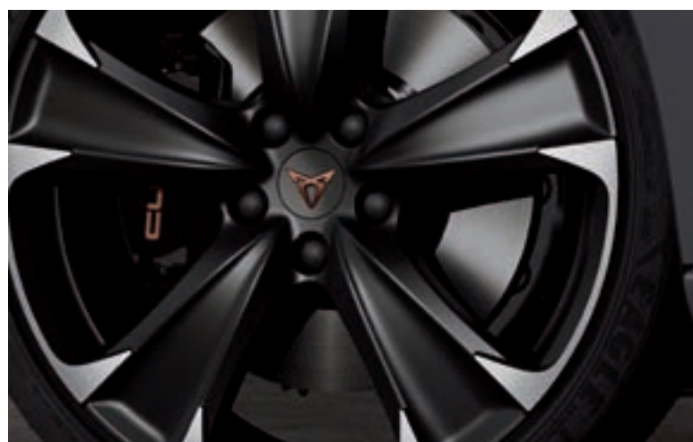
19" MACHINED SPORT BLACK / SILVER WHEELS