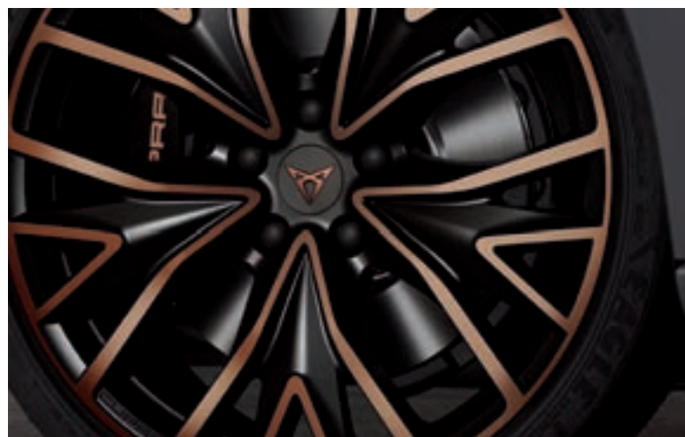
19" PERFORMANCE COPPER / BLACK WHEELS