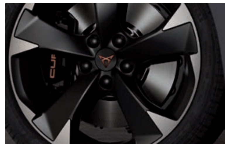
18" MACHINED SPORT BLACK / SILVER WHEELS