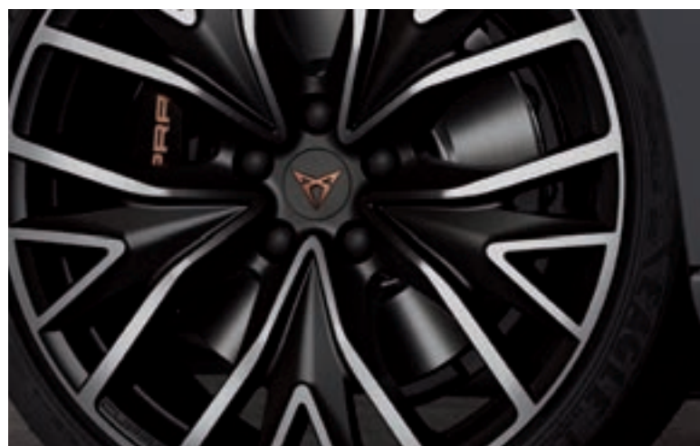
19" PERFORMANCE SPORT BLACK / SILVER WHEELS