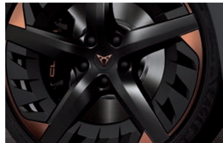
19" AERO DESIGN MACHINED BLACK / COPPER WHEELS