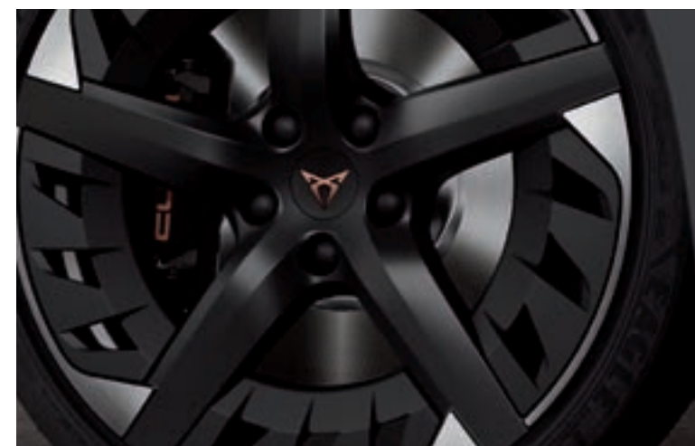
19" AERO DESIGN MACHINED SPORT BLACK / SILVER WHEELS