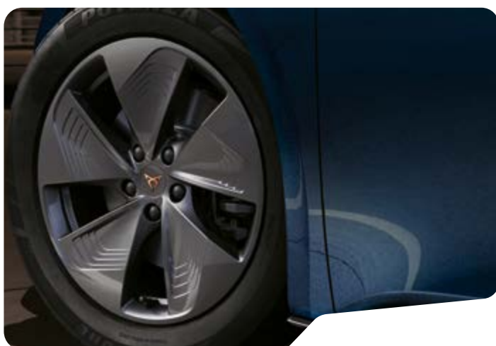
↑ 18" CYCLONE S